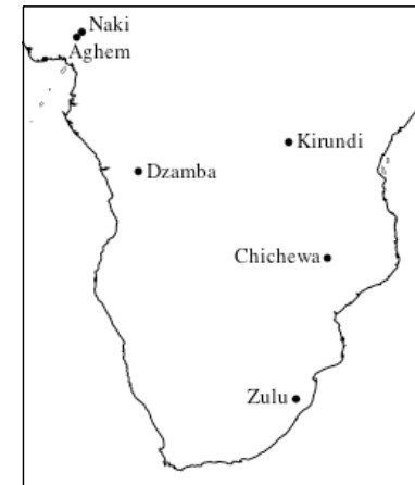
Approximate locations of languages discussed Map adapted Guillaume Segerer’s African Pronouns project < http://sumale.vjf.cnrs.fr/pronoms/ >