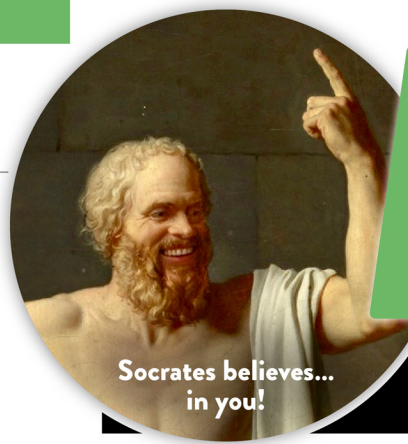
Socrates believes... in you!