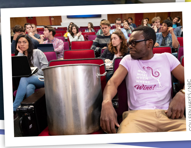
COLLEEN HAYES / NBC