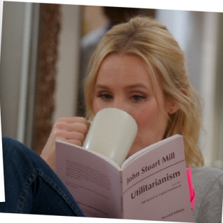
MORGAN SACKETT / NBC