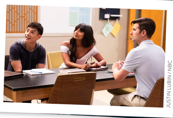
JUSTIN LUBIN / NBC