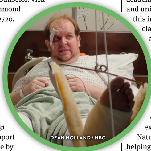
DEAN HOLLAND / NBC