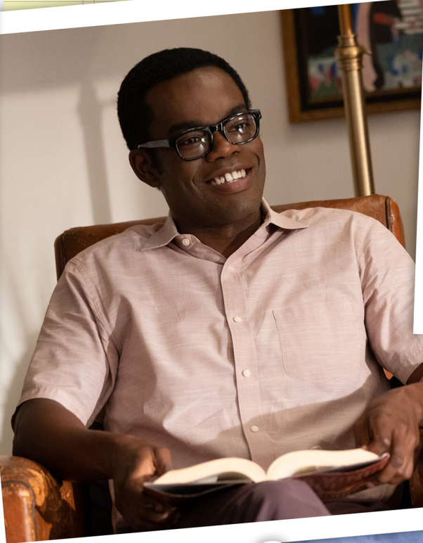
COLLEEN HAYES / NBC