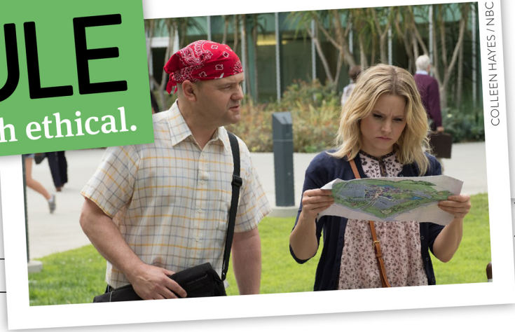
COLLEEN HAYES / NBC