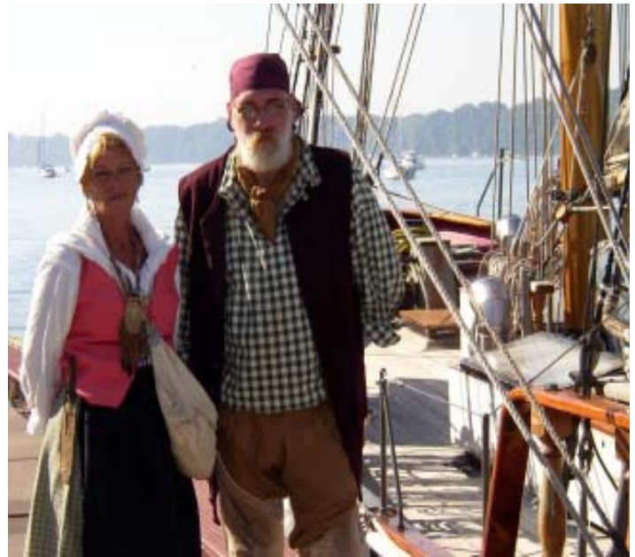
Tall Ship re-enactors helped celebrate the 250th anniversary of Captain Pierre Pouchot's arrival at Fort Niagara ( page 6)