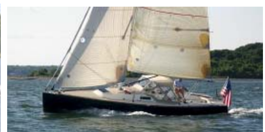
New J/100 Is Launched

We have put our Youngstown Showroom back into service again and currently have three new boats inside for viewing. The exciting new J/100, thirty-three feet of pure sailing enjoyment, is inside along with two powerboats: the Back Cove 26 and 29. If you have not yet seen a Back Cove you should do so soon; they are jewels of Maine craftsmanship but at attractive prices. Back Cove is a Sabre company, and we are thrilled to have such a super product to introduce to this area.