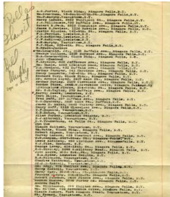
"By July 4, 1931 YYC had now grown to 80 members. Most of these early members are listed on the historic member list reproduced here."

One of the best ways to get to know fellow club members is to work together on a project or a committee. It makes for smooth sailing when we share our talents and resources to the benefit of our Club. Become a part of the YYC's history. Join the YYCA! Jump on board!! Remember... membership is open to all members of the Youngstown Yacht Club.