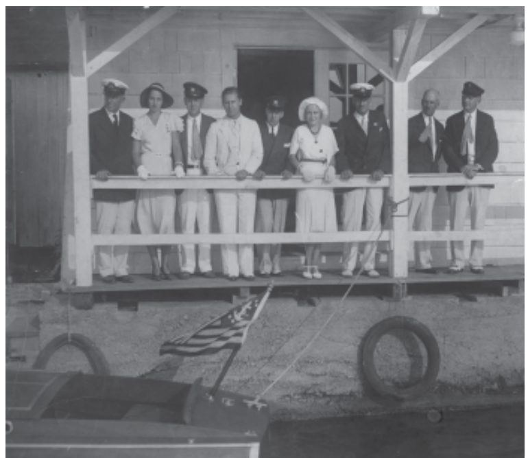
Photograph taken during the Clubhouse opening even. Officers and other attendees are shown enjoying the newly constructed balcony "overhanging the water."