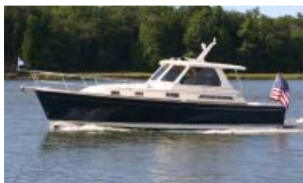
Sabreline 38 Hardtop Express