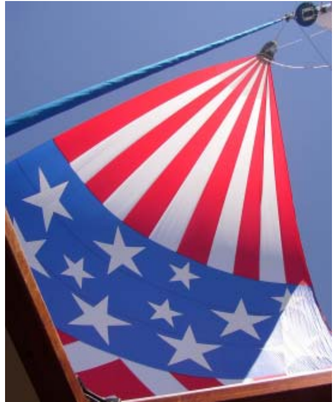
Liberta is ready to help celebrate July 4th!