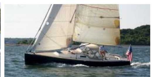
New J/100 Is Launched

We have put our Youngstown Showroom back into service again and currently have three new boats inside for viewing. The exciting new J/100, thirty-three feet of pure sailing enjoyment, is inside along with two powerboats: the Back Cove 26 and 29. If you have not yet seen a Back Cove you should do so soon; they are jewels of Maine craftsmanship but at attractive prices. Back Cove is a Sabre company, and we are thrilled to have such a super product to introduce to this area.