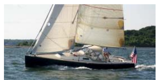
New J/100 Is Launched

We have put our Youngstown Showroom back into service again and currently have three new boats inside for viewing. The exciting new J/100, thirty-three feet of pure sailing enjoyment, is inside along with two powerboats: the Back Cove 26 and 29. If you have not yet seen a Back Cove you should do so soon; they are jewels of Maine craftsmanship but at attractive prices. Back Cove is a Sabre company, and we are thrilled to have such a super product to introduce to this area.