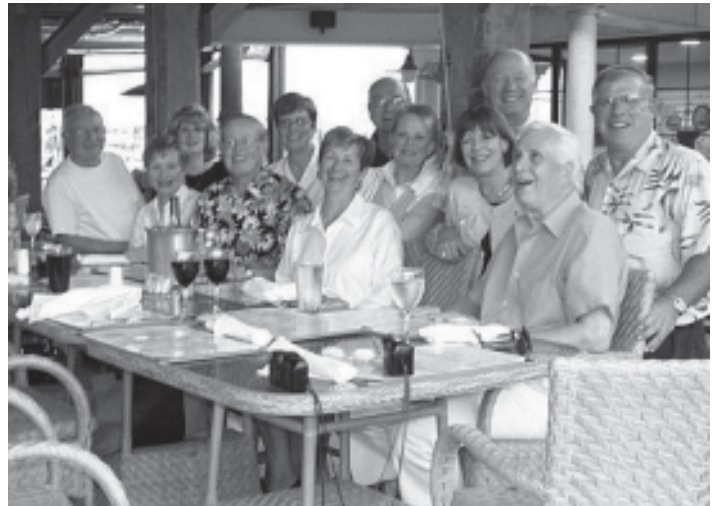
Last Year's Snowbirds in Punta Gorda