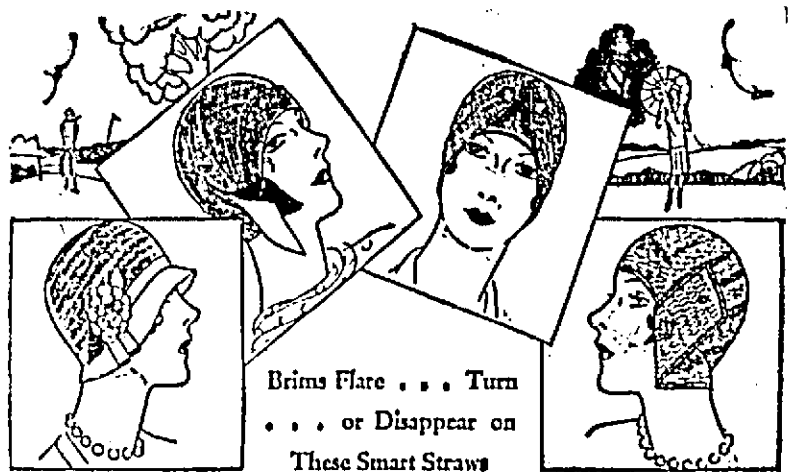
Brims Flare . . . Turn . . . or Disappear on These Smart Straws