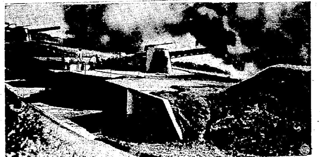
"Big Berthas" of Great Britain's coast defense, shown in hitherto unpublished picture blasting away in a practice session. Capable of throwing a shell across to France, they take on new importance under the ever-present threat of a German air and sea attack on England.