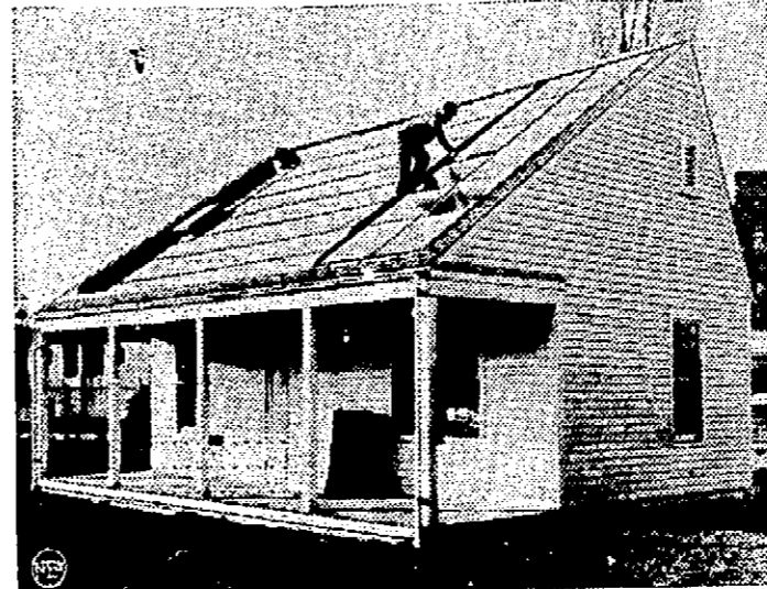
There'll be no more fuel bills if plans to trap the heat of the sun in summer for winter use work out for Massachusetts Institute of Technology engineers at Cambridge, Mass. Energy collectors on roof of house, above, contain water in coils to be heated by sun and stored in insulated basement tank for cold weather use.