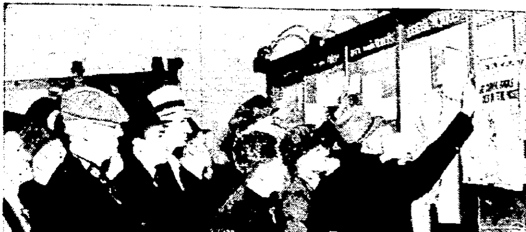
Many American seamen are losing jobs because neutrality law hails U. S. shipping to belligerent waters. The men, unlike ships, can't transfer to an alien registry and go on working. This group scans bulletin board at their union for jobs on other ships.