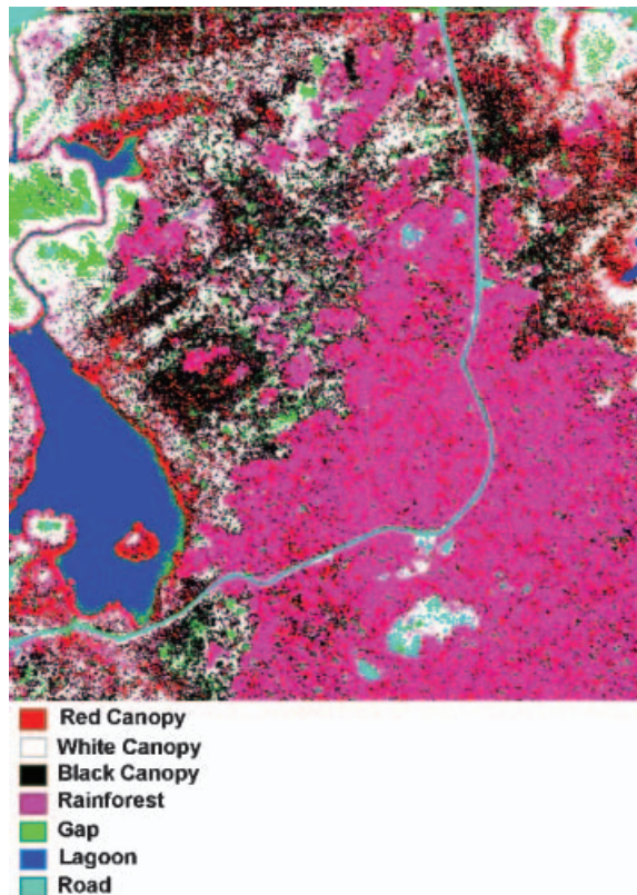
Figure 3. Classification with MLCNN.