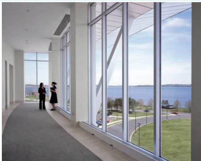
The Campus Center overlooks Boston harbor