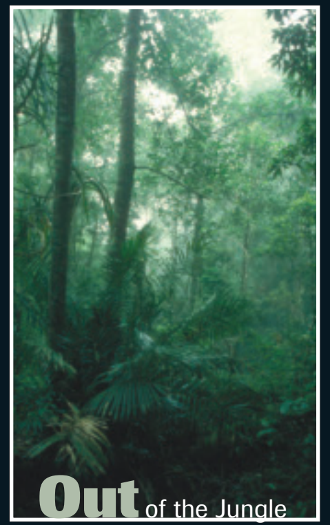
continued from page 11

schools, however, is misplaced or at least incomplete. How can we expect first-year law students to learn research in the first year when they have no opportunity to practice their research skills in any of their other classes and when they are thoroughly occupied with learning the basics of the substantive first-year curriculum?